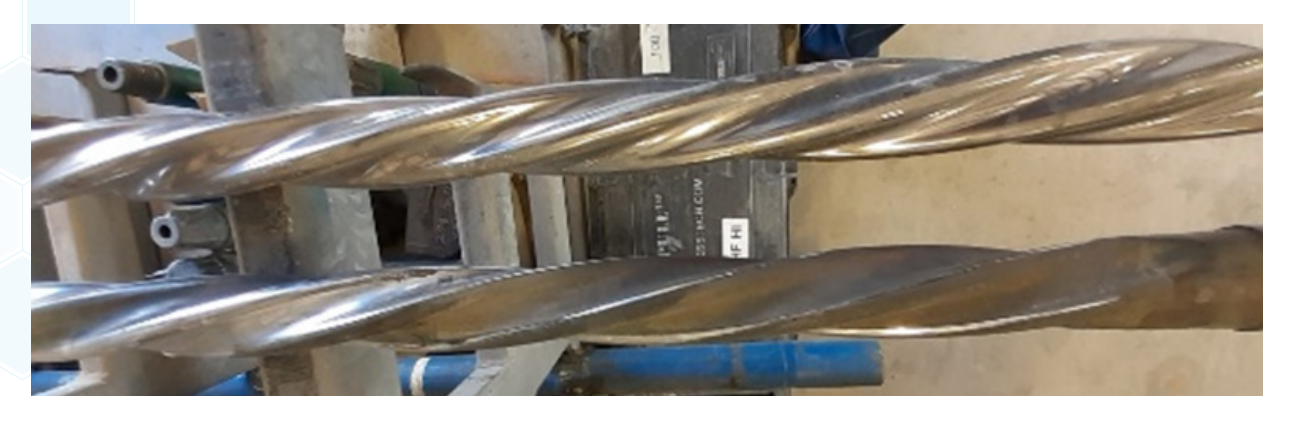
Figure 3: Motor after contact with HCR-7000-WL (top) and 15% HCl (bottom).

After the first treatment, the motor for the drill bit was inspected for corrosion due to contact with HCR-7000-WL. No damage to the rubber or the chrome coating on the stator was observed.