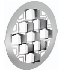
10" Flange Mounted